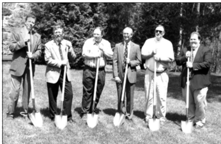
The small town of Clifton, New York, will soon have a new drinking water system, thanks to a partnership between local officials, the largest business in the area—Appleton Paper Company, federal funders, and a state self-help program.